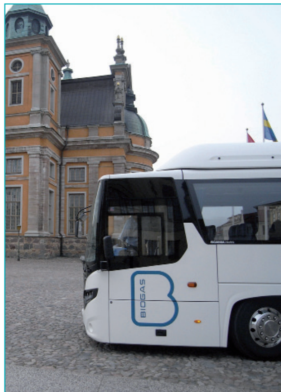
A biogas bus in front of Kalmar's cathedral

Kalmar County has a target to become a fossil fuel free county in 2030 with no net greenhouse gas emissions. This target was set by the Climate Commission consisting of the County Administrative Board, the Regional Council of Kalmar County as well as different private and public organisations. Kalmar, the county's main city, aims to reduce its CO 2 emissions by 50% by 2020 compared to 2008 levels. To reach this ambitious target, several sub targets have been set. One of them is that all transport paid by public means in the County shall be fossil fuel free by 2020, reducing emissions by approximately 6,000 tonnes /year. Since there are very good conditions to produce biogas especially from manure and many farmers are interested in producing biogas, the Regional Council of Kalmar County set a 65% biomethane target in the procurement. Launched in 2014, it consisted of approximately 400 vehicles and it was worth about €500 million.